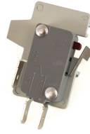
DIAL NO. 70503