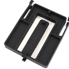
DIAL NO. 70505